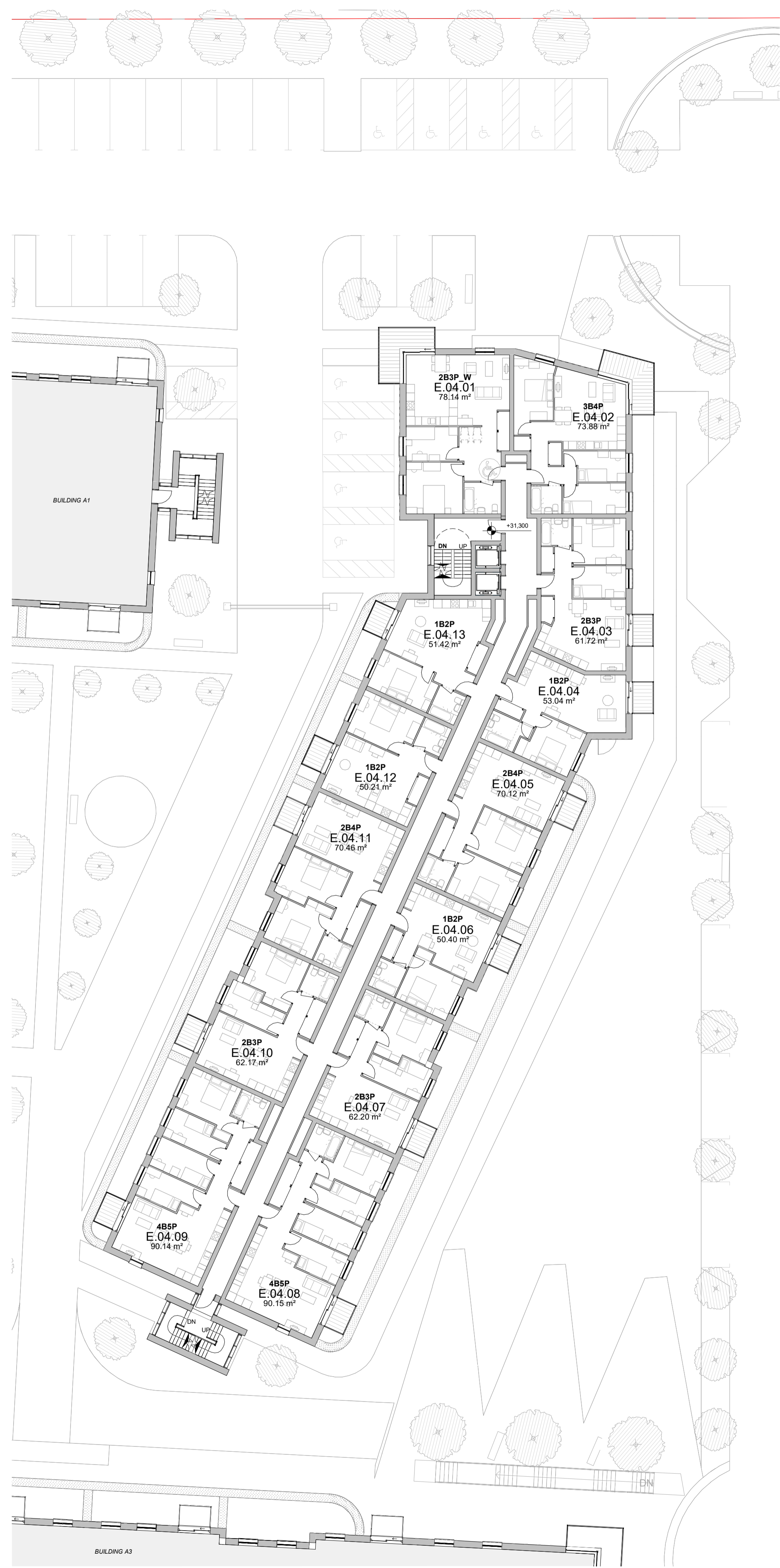
1 Level 4 +31.300 AOD 1:200